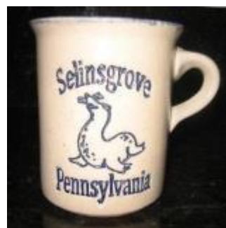
Our 2013 Mug Selinsgrove Happy Seal Available at the Circulation Desk at the Gelnett Library, Selinsgrove

Mugs are microwaveable and dishwasher safe!