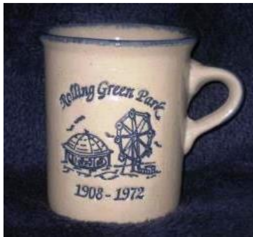
Our 2014 Mug Rolling Green Park Available at the Circulation Desk at the Gelnett Library, Selinsgrove